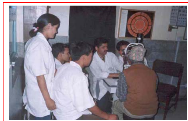
Students learning from Ophthalmologist