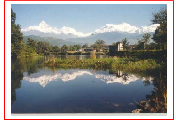
Shadow of Fishtail on Fewa

Pokhara can be accessed by road or air. Kathmandu is the entry point while flying in. Flying time between Kathmandu and Pokhara is 25 minutes. The journey takes 5 hours by road. Air tickets for Pokhara are available on the spot. Taxi service is available from Pokhara airport to Himalaya Eye Hospital, which is just 1.5 km away.