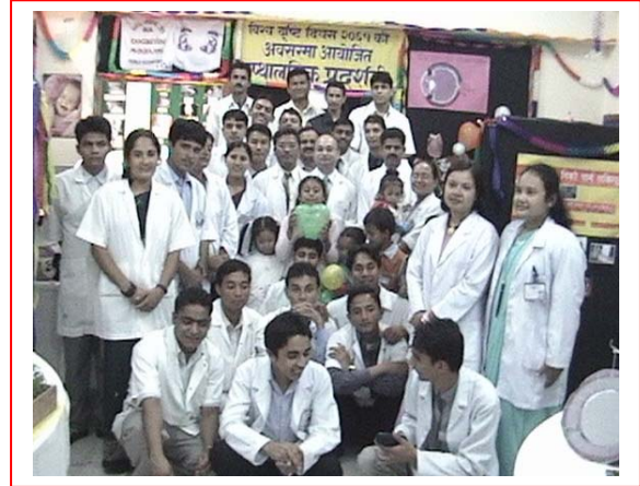
Students & Supervisors

During the posting of student in different units, student will require to do as advised by supervisor. In every unit, there will be a supervisor, who will facilitate student in learning. In consultation room, they will sit together with ophthalmologists and acquire knowledge on different types of diseases and their treatments.